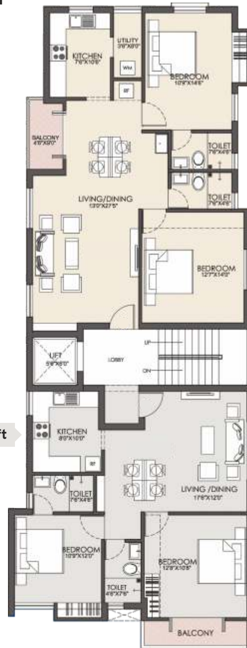
FIRST & SECOND FLOOR